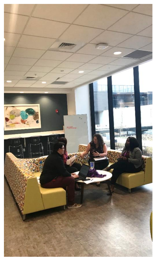
Staff "Co-Op" Gathering Area