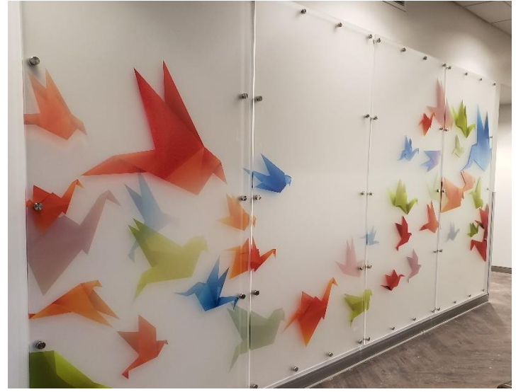
Beautiful art throughout the building to create calm for clients & staff