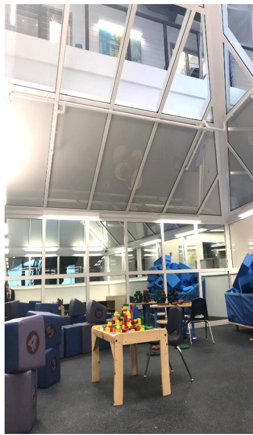
Kids Play Pyramid