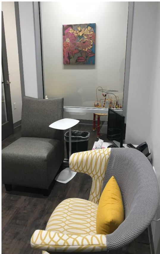
Client Support Room