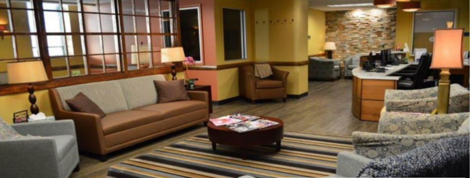
The living room area at the Jean Crowe Advocacy Center