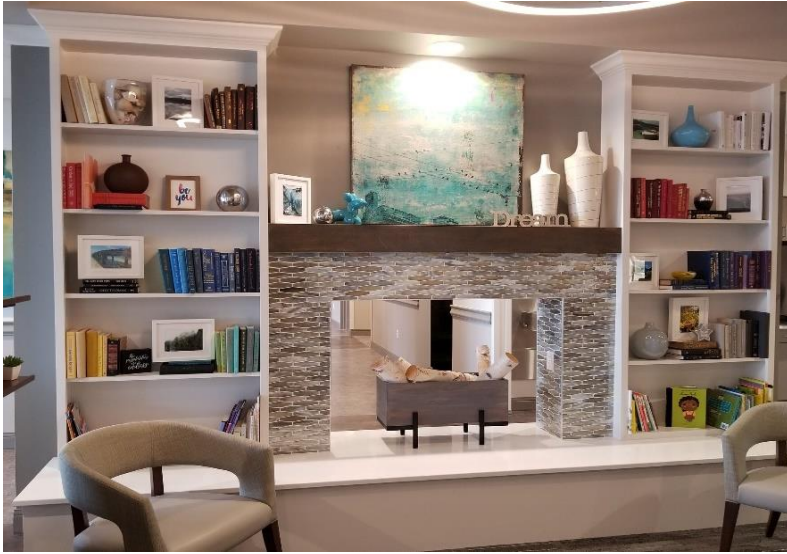
FSC Waiting Area with relaxing fireplace