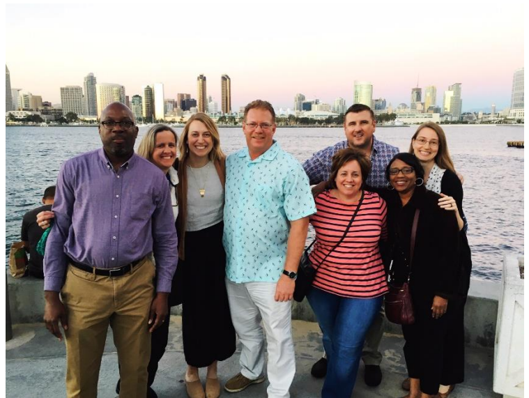
Nashville's Team at the FJC Alliance's Strangulation Institute in San Diego