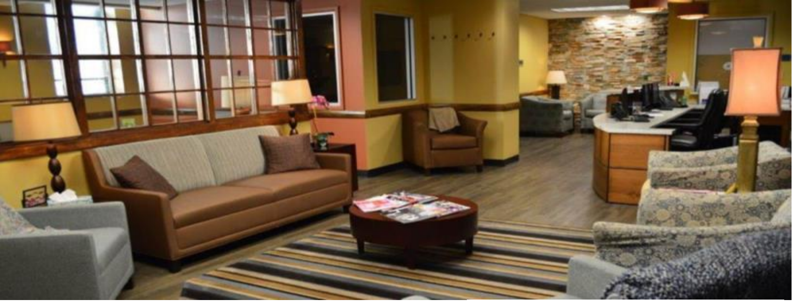
The living room area at the Jean Crowe Advocacy Center