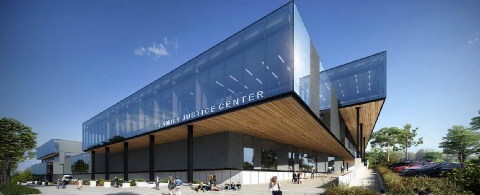
A rendering of the front of the new Family Safety Center