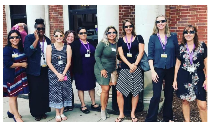
JCAC staff step outside to enjoy the total eclipse

"Everyone is so calm and friendly and gives you a feeling of comfort and safety. All of the resources they happily made available helps the feeling of hopelessness, or feeling I didn't deserve it."- JCAC Client