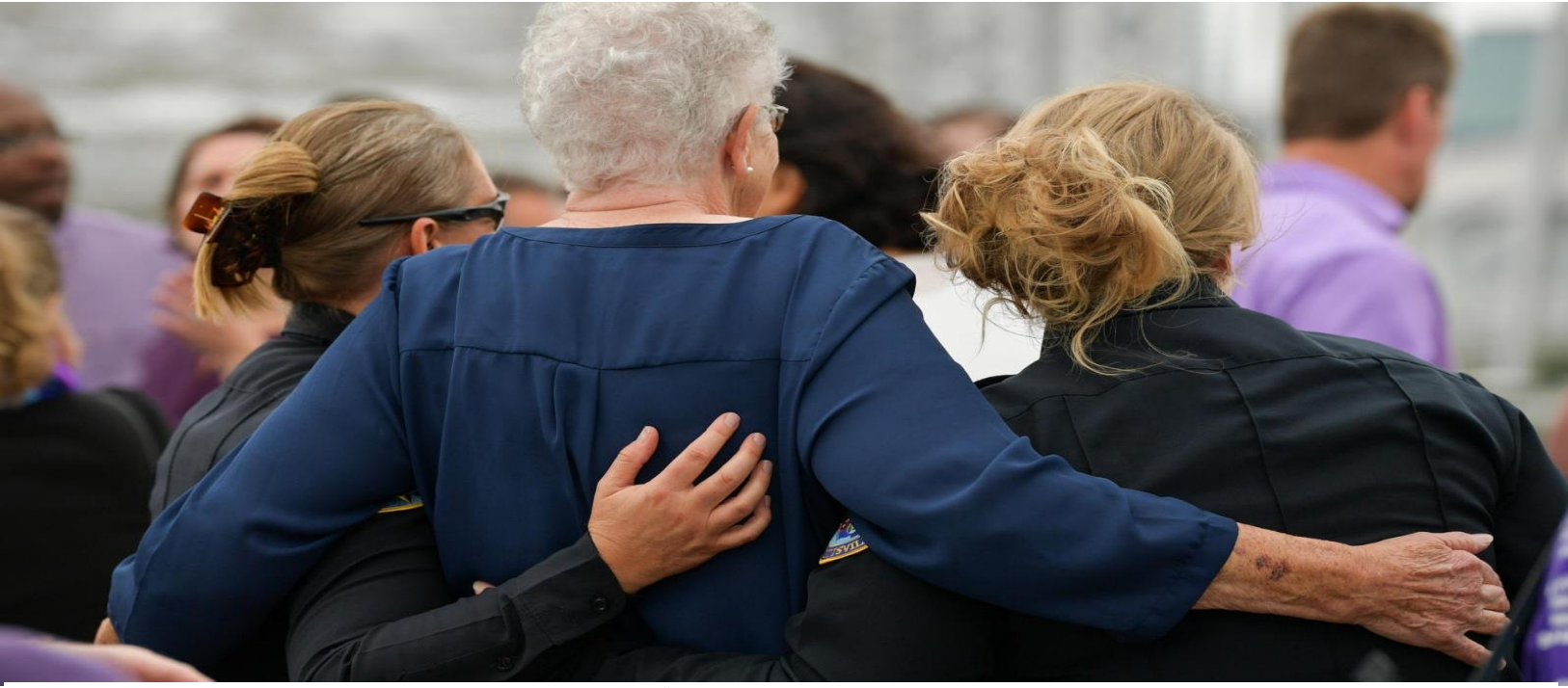
Nashville's annual "Meet Us At The Bridge" Ceremony honors those who have lost their lives to domestic violence.