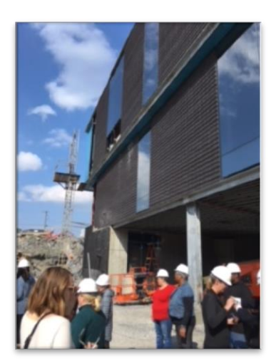
OFS employees tour the new FSC together

For more information on the new Family Safety Center, email <a href="mailto:FSCINFO@jis.nashville.org">FSCINFO@jis.nashville.org</a>.