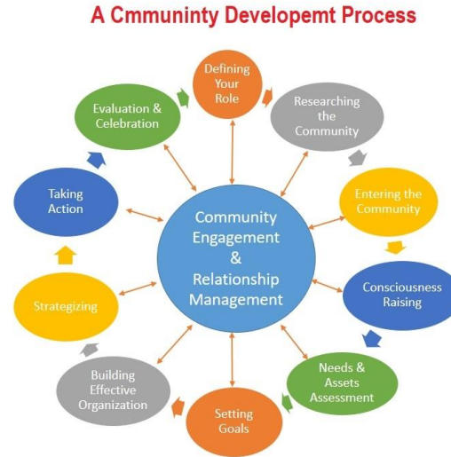
Figure created by Author based on Brown & Hannis, 2012, p.84